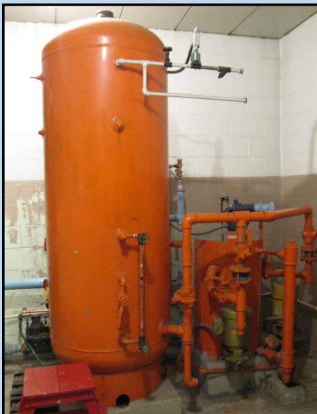
Existing compressor system & tank for flushing old pump seals, eliminated with Flygt dry pit Pumps

PROBLEM: The City of Flat Rock, MI had big clogging and maintenance issues with their pumps clogging at their Gibraltar Road Lift Station for years. The partially plugged pumps ran inefficiently, using excessive energy and when the pumps would stop working all together, City personnel would have to pull them and remove debris. This resulted in excess overtime, personnel safety risks, and expensive repair costs. The seal water system also required a large compressor system & tank in the control building to flush the old pump's mechanical seals, which added to their maintenance costs. Flat Rock needed a solution to their pump clogging and seal water problems and fast. They planned to implement their solution into an upgrade & repair project that was sent out to contractors for competitive bid.